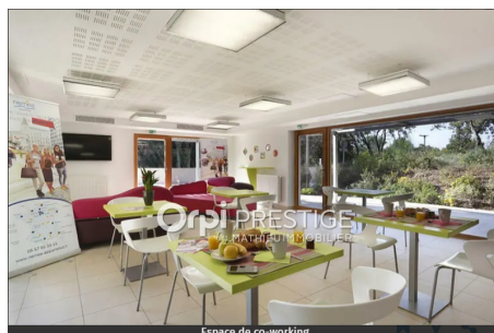
Espace de co-working